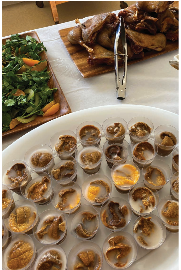
Marinated kina, slow-cooked weka and watercress salad at our 2020 AGM